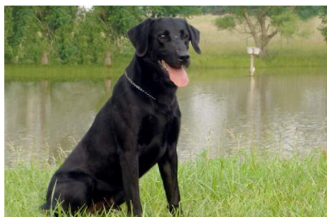
National Upland Classic Series 2006 National Champion

NUCS National Champion Rolling Hills of Moon Rivers